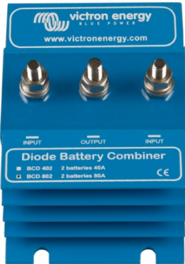
Argo Diode Battery Combiner BCD 802

Diode Battery Combiners are used to guarantee continuous DC power to mission critical equipment, such as an electronic engine control system. With a diode battery combiner two or more DC power sources can be used in parallel to supply the mission critical load. Failure of one source will not interrupt power to the critical load.